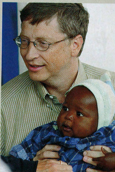
IN MOZAMBIQUE Bill meets a small client.