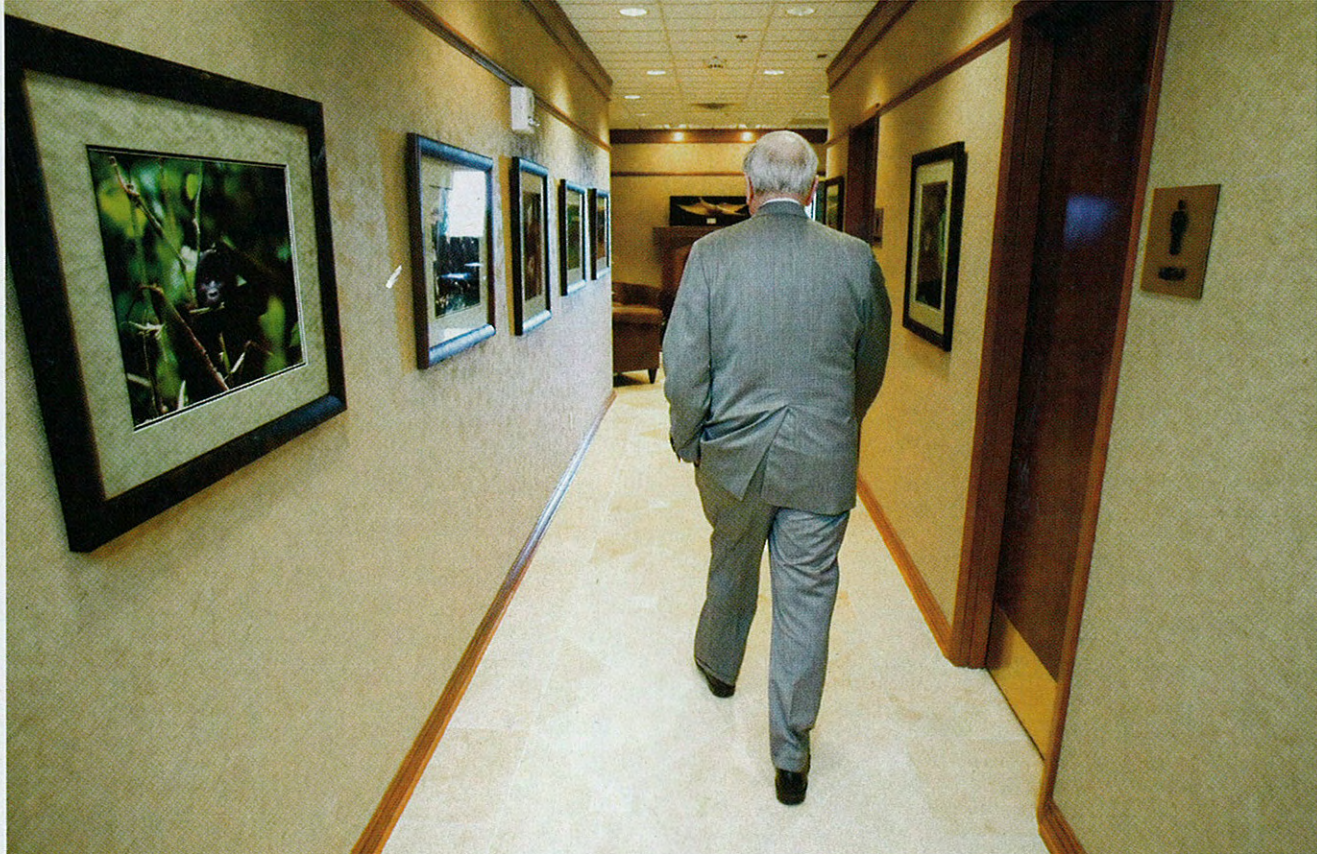
THE FATE OF HIS FORTUNE SEALED, Buffett (at Omaha headquarters) will, as usual, be focusing on the job he loves: running Berkshire Hathaway.

And, you know, though this may surprise some people, it's a non-event for me too in some ways. Ted Turner, whose philanthropic activities I admire enormously, once told me that his hands shook when he signed a $1 billion pledge. Well, I have zero of that. To me, there's just no emotional downside to this at all.